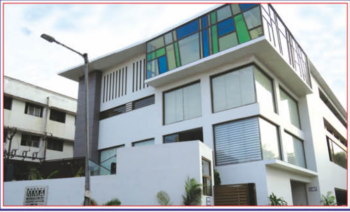
MMA Management Center