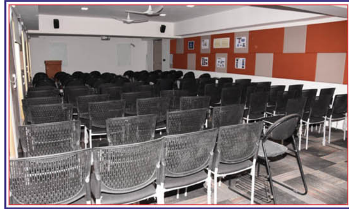
Lecture Hall-1: 100 👤