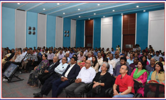
Seminar Hall: 315 👤