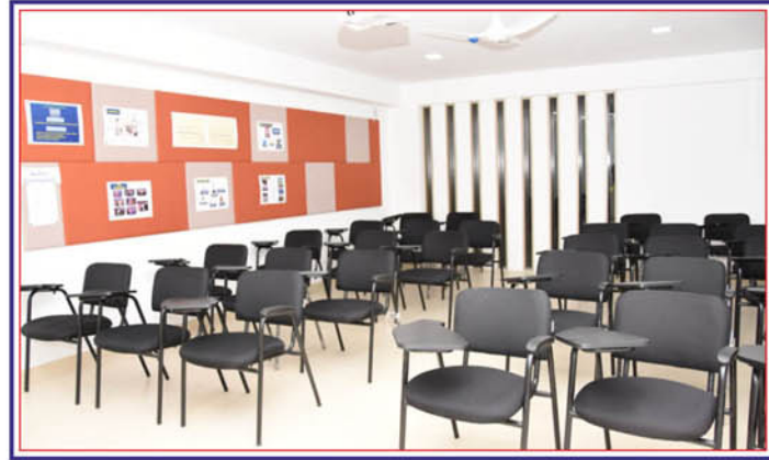
Lecture Hall-3: 35 👤