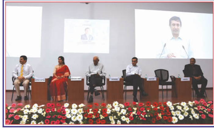
Spacious Stage: Seminar Hall