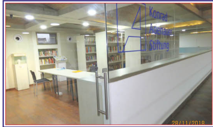
MMA-Konrad Adenauer Library with Kindle - Audio book, Management Videos & much more!